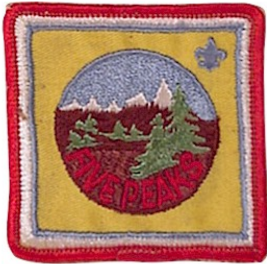
FIG. 7-1 5 PEAKS 3" x 3"