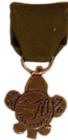
FIG. 7-2 5 PEAKS MEDAL 1" x 2½"