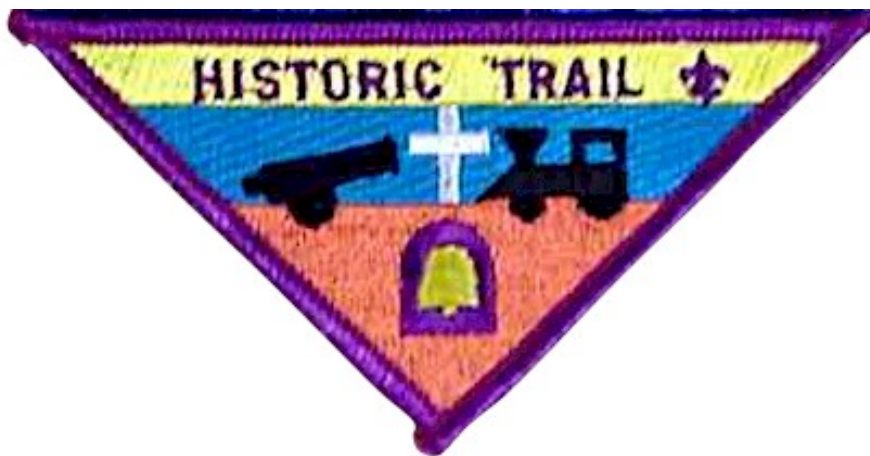
FIG. 8-10 HISTORIC TRAIL 4" x 2"

While on the trail, each unit is expected to obey the pedestrian safety rules as well as the point of the Scout Law "A Scout is Courteous". Each group must see that it has training in hiking safety and first aid. No participant may hike the trail as an individual. The sponsor of the trail will not be responsible for any accidents which may occur during the course of the trail. Each group is responsible for its own safety and discipline as well as obeying pedestrian and traffic safety rules. Church services, restaurants, and food supplies are available in San Luis Obispo, San Miguel, and surrounding communities. For emergencies, call 911. Write to the Los Padres Council office for maps and additional information.