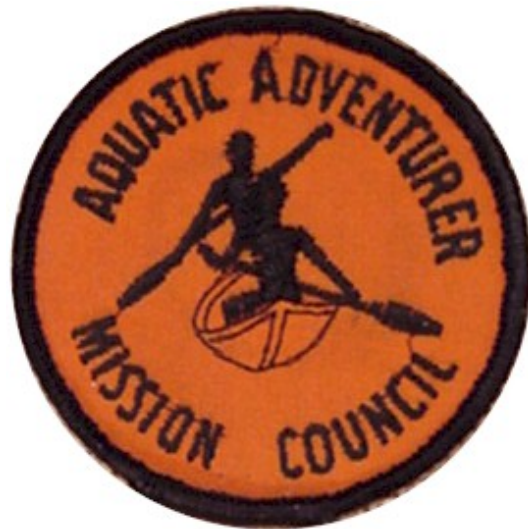
FIG. 8-1 AQUATIC ADVENTURE 3"DIA.