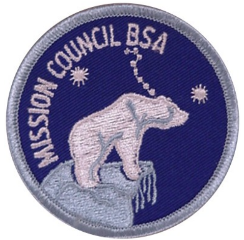
FIG. 8-5 POLAR BEAR 3" DIA.