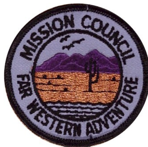
FIG. 8-2 FAR WESTERN ADVENTURE 3" DIA.