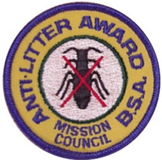
FIG. 8-6 ANTI-LITTER 3" DIA.