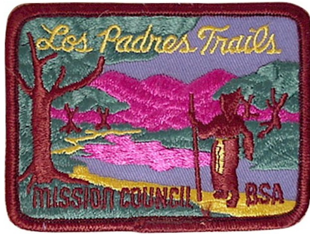
FIG. 8-3 LOS PADRES TRAILS 4" x 3"