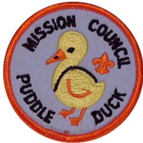
FIG. 8-7 PUDDLE DUCK 3" DIA.