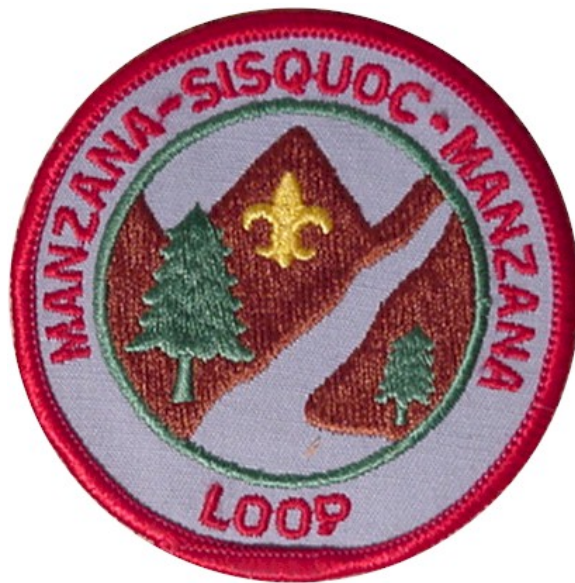
FIG. 8-8 MANZANA-SISQUOC-MANZANA LOOP 3" DIA.