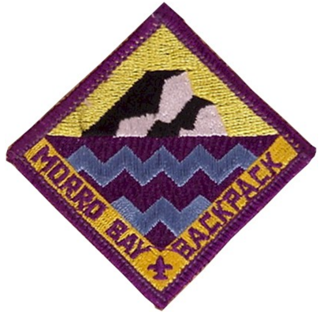
FIG. 8-11 MORRO BAY BACKPACK 2" x 2"

This is an overnight backpack of 7.5 - 8.5 backpack hours duration. It is intended to enhance knowledge and appreciation of the variety of environments near the Pacific Ocean on the Central Coast of California. The trailhead is at Morro Bay State Park Natural History Museum. The primary route winds through the State Park to the top of Black Hill and then down into the City of Morro Bay. A Clam Taxi ride provides access to the northern tip of the Morro Bay Strand, near the entrance of Morro Bay Harbor. The Clam Taxi is located at the Morro Bat Marina (phone: 805/772-8085). The long trek down the strand to Hazard Canyon should take tidal conditions into account. From Hazard Canyon, the trail ascends to Pecho Road and turns south to the Montana de Oro Park Ranger Station. Follow the path along the bluffs to Coon Creek and turn east to rejoin Pecho road. Follow the road to the turnoff to your Environmental Camp. The E.C. is reserved by calling MISTIX (phone: 800/444-7275). Remember, none of the E.C. areas have any immediate water source. The alternative trail leads from Morro Bay State Park to South Bay Boulevard, turns west to Pine, proceeds south to Binscarth, leads west to Pecho Road, crosses over to Solano Street, and continues to the west end of Howard Street. From here, take a sandy path that parallels the edge of the