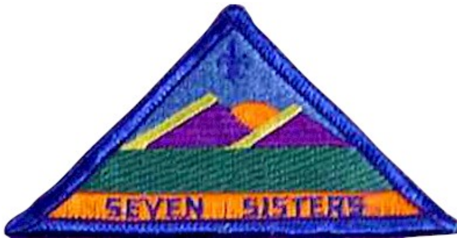
FIG. 8-12 SEVEN SISTERS 4" x 2" TRIANGLE