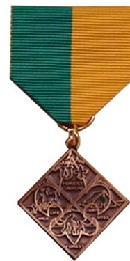
FIG. 10-9 FOREST SAVER MEDAL 1½" x 3"