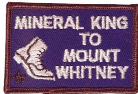
FIG. 10-27 MINERAL KING TO MT. WHITNEY 3" x 2"