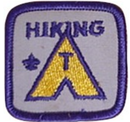
FIG. 10-1 TRAINING HIKE 2" x 2"