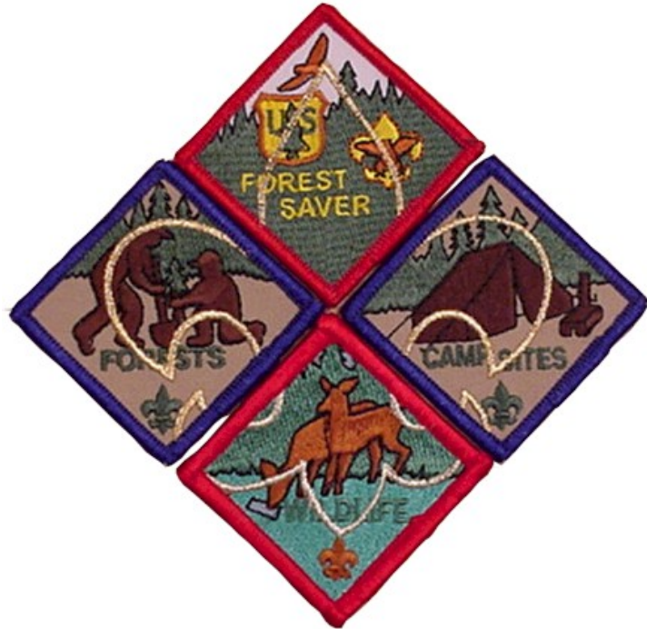
FIG. 10-8 FOREST SAVER AWARD 5" x 5"

Please refer to the LAAC-HAT Program Announcement, "Forest Saver Program", for additional information on this award series.