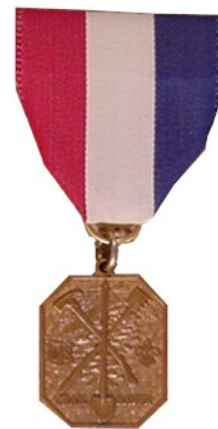
FIG. 10-14 30-HOUR MEDAL 1½" x 3"