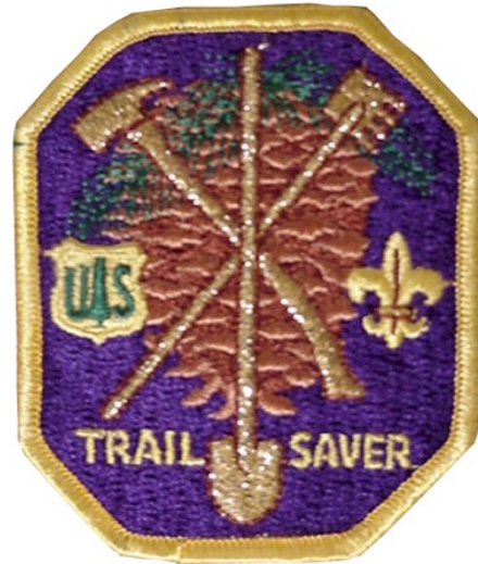
FIG. 10-12 18-HOUR GOLD TRAILSAYER 3" x 3½"