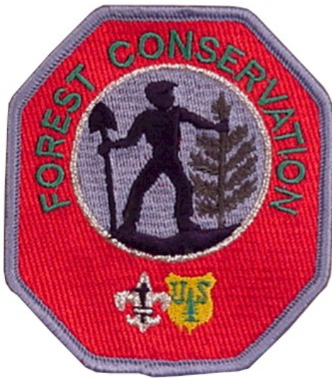
FIG. 10-11 12-HOUR FOREST CONSERVATION 3" x 3"