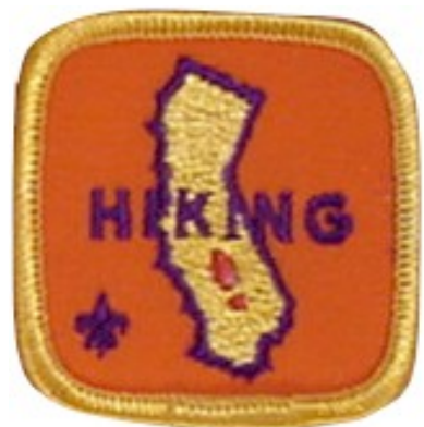
FIG. 10-3 STATE / COUNTY PARK 2" x 2"