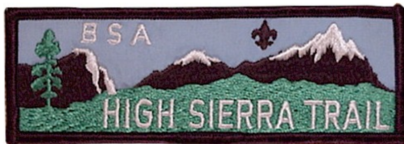
FIG. 10-25 HIGH SIERRA TRAIL 6" x 2"