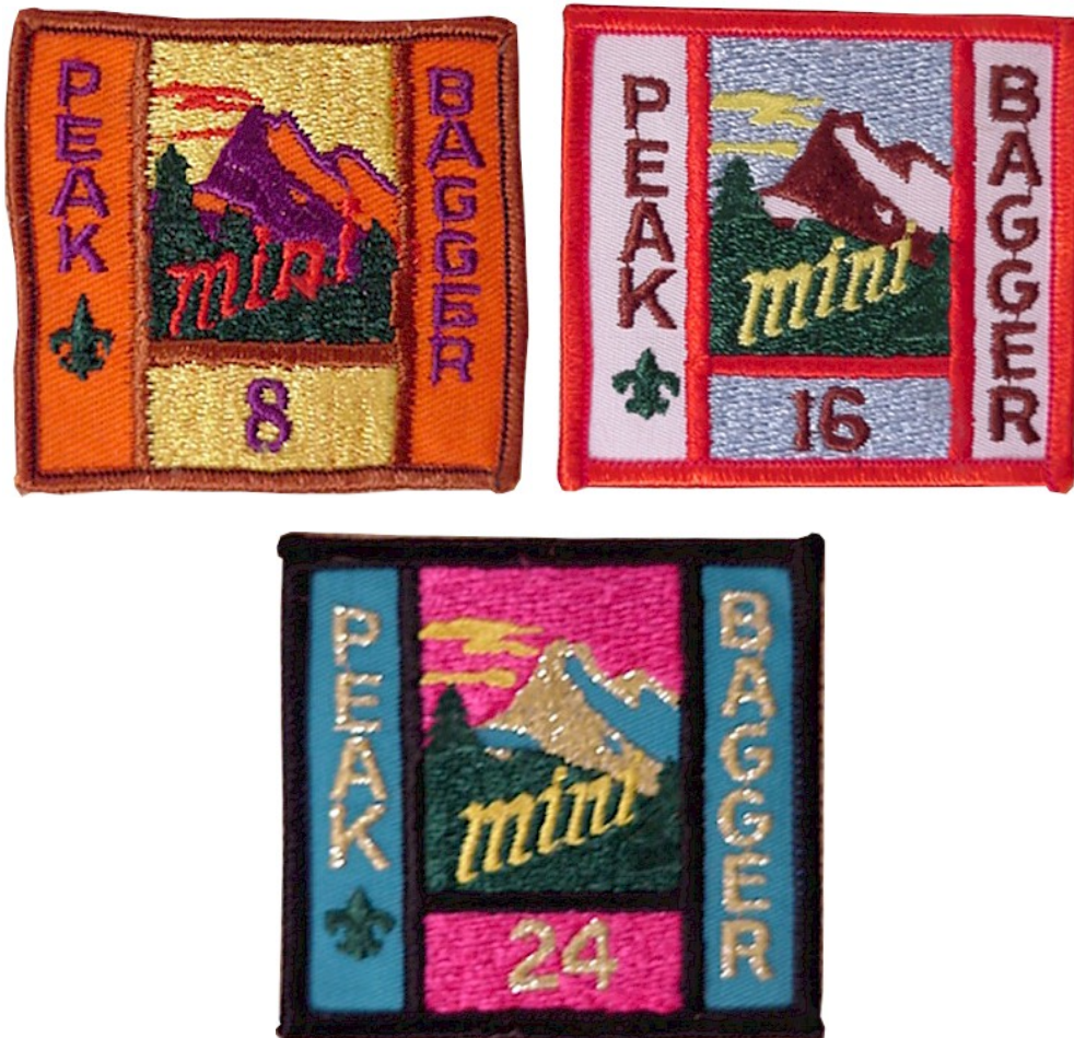
FIG. 10-20 MINI PEAK BAGGER 3" x 3"

Please refer to the LAAC-HAT Program Announcement, "Mini-Peak Bagger Award", for additional information and a listing of the eligible peaks. This also contains a Mini-Peak Bagger Award Record form for applying for an award.