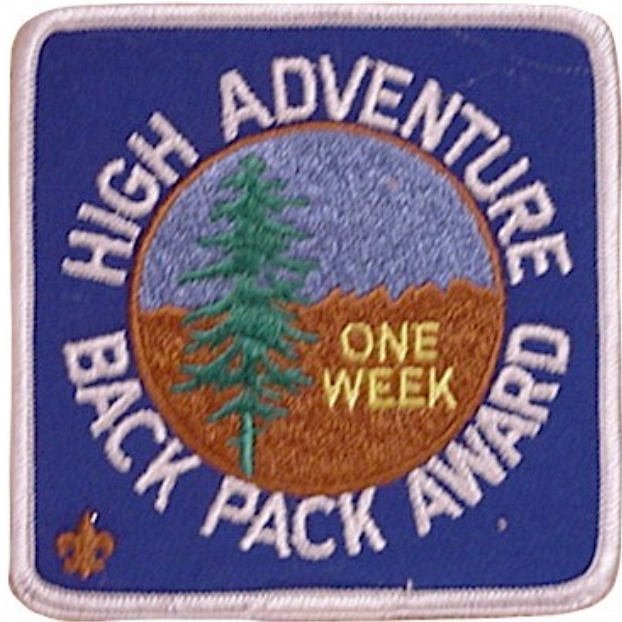
FIG. 10-17 HIGH ADVENTURE BACKPACK 4" x 4"