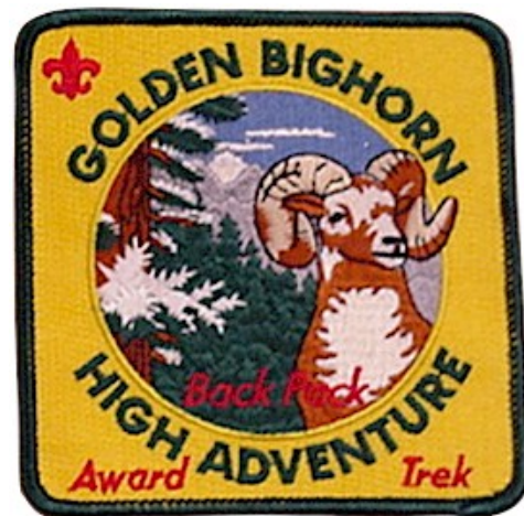
FIG. 10-30 GOLDEN BIGHORN TREK 3" x 3"