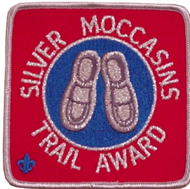
FIG. 10-23 SILVER MOCCASIN 4" x 4"