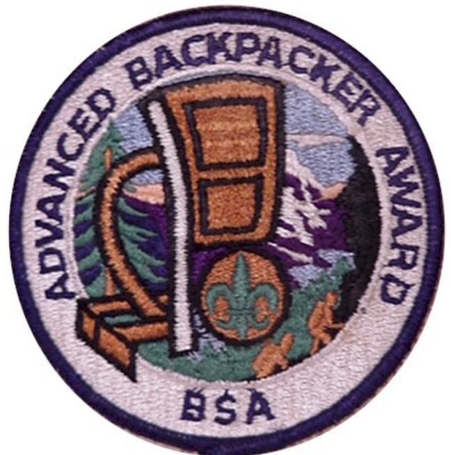
FIG. 10-7 ADVANCED BACKPACKER 4" DIA.