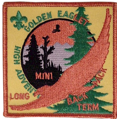
FIG. 10-29 GOLDEN EAGLET 3" x 3"