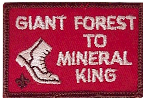
FIG. 10-26 GIANT FOREST TO MINERAL KING 3" x 2"