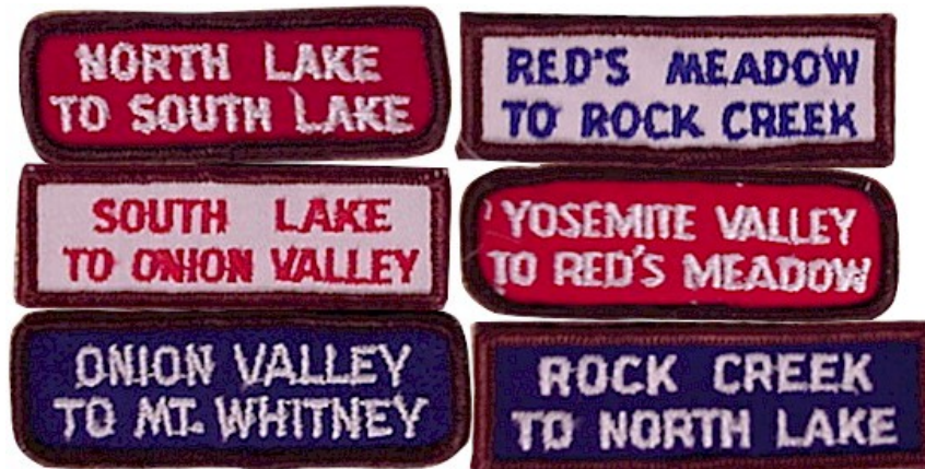
FIG. 10-19 JOHN MUIR TRAIL SEGMENTS 3" X ¾"