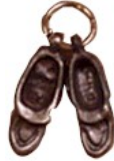
FIG. 10-24 SILVER MOCCASIN MEDAL 1" x 1"

Please refer to the LAAC-HAT Program Announcement, "The Silver Moccasins Hike", for additional information about this award.