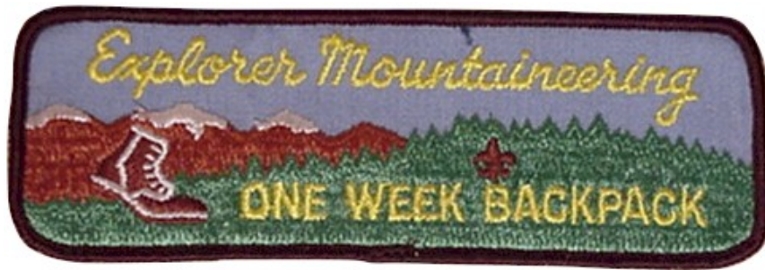
FIG. 10-15 EXPLORER MOUNTAINEERING 1-WEEK BACKPACK 6" x 2"