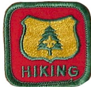
FIG. 10-4 HIKE IN A NATIONAL FOREST 2" x 2"