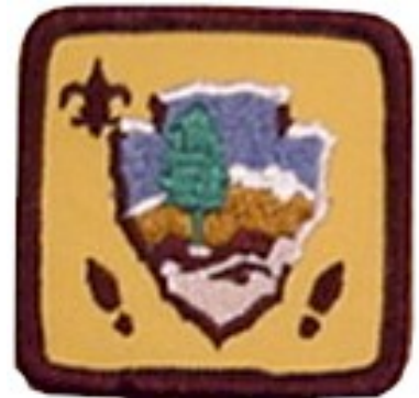
FIG. 10-2 NATIONAL PARK / MONUMENT 2" x 2"