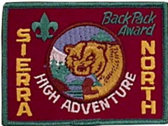
FIG. 10-21 SIERRA NORTH 3" x 2½"