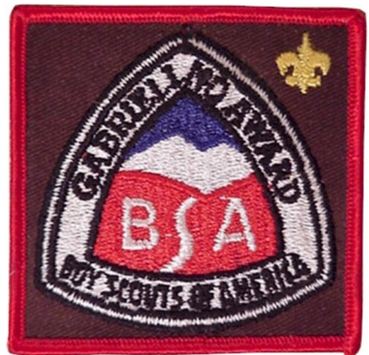
FIG. 10-16 GABRIELINO 3" x 3"