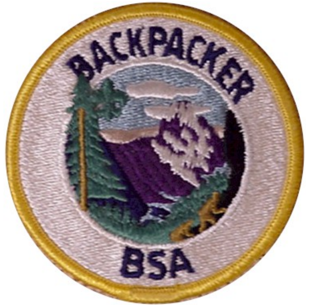
FIG. 10-6 BACKPACKER 3½" DIA.