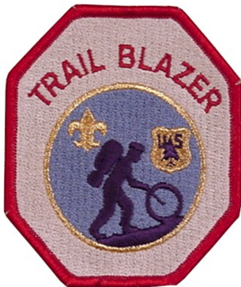
FIG. 10-13 24-HOUR TRAILBLAZER 3" x 3"