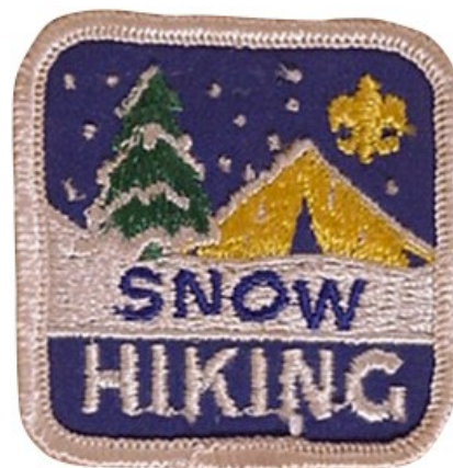
FIG. 10-5 SNOW HIKING 2" x 2"