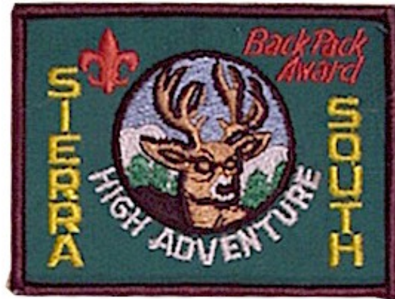
FIG. 10-22 SIERRA SOUTH 3" x 2½"