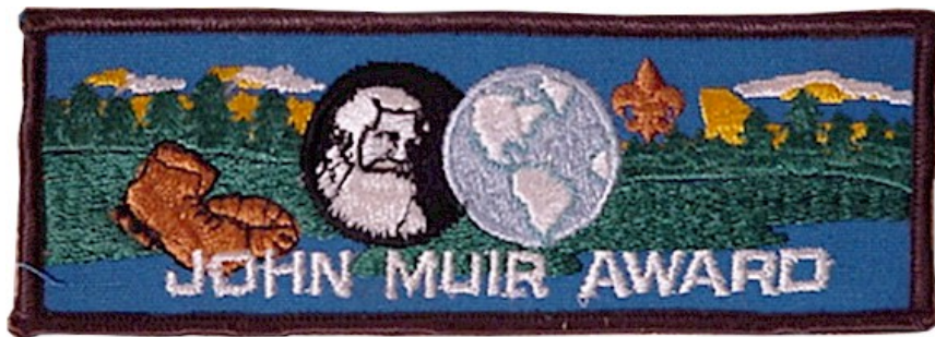
FIG. 10-18 JOHN MUIR AWARD 6" x 2"

Please refer to the LAAC-HAT Program Announcement, "John Muir Trail", for additional information about these awards.