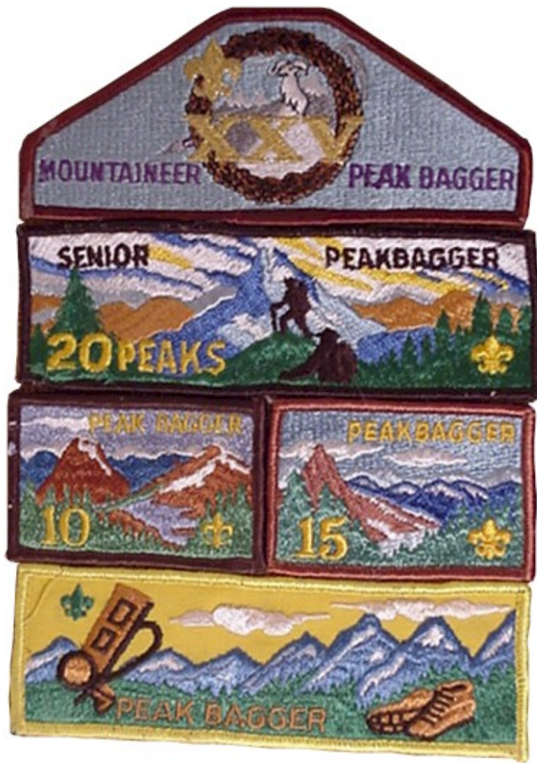
FIG. 10-28 PEAK BAGGER