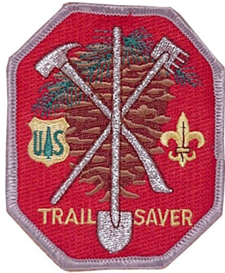
FIG. 10-10 6-HOUR SILVER TRAILSAYER 3" x 3½"

The awards are earned in six (6) hour increments on a cumulative basis. Please refer to the LAAC-HAT Hike Aid 7, "Trail Conservation", for additional information about this program. The appendix of the Hike Aid contains a form, Conservation Award Log, to be used to obtain awards.