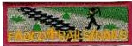
FIG 14-9 FADED TRAILS OR RAILS 1" x 3"