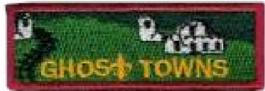
FIG. 14-5 GHOST TOWNS 1" x 3"