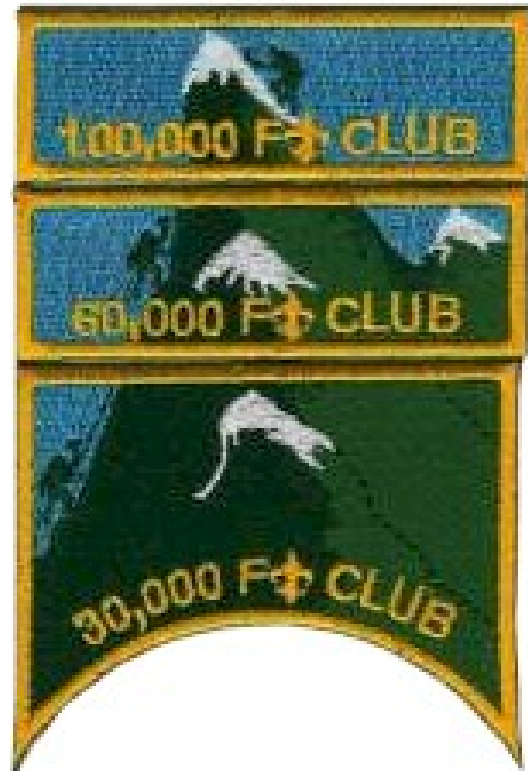
FIG. 14-8 30,000 60,000 100,000 FT CLUB 1" x 3"