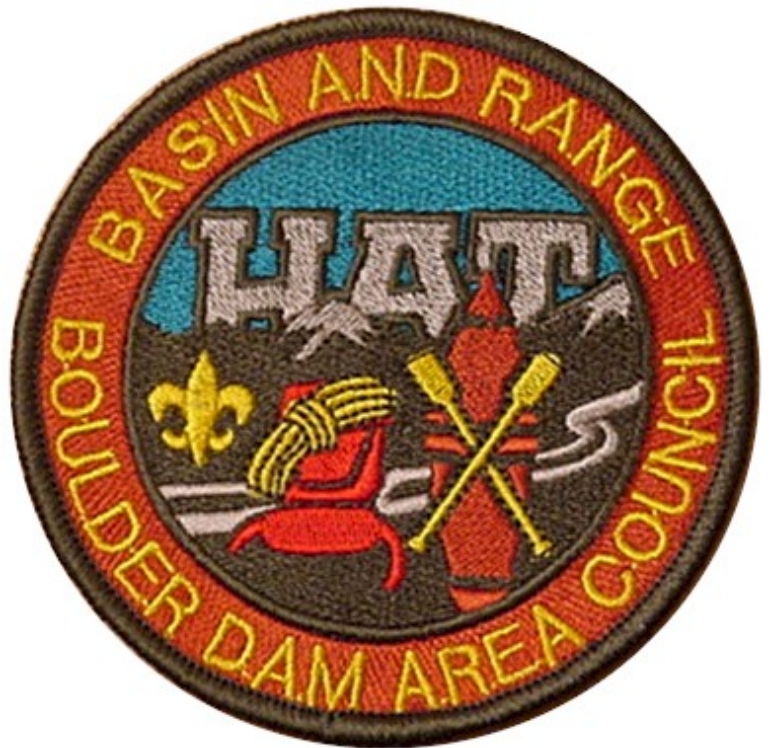
FIG. 14-1 BASIN & RANGE TRAILS AWARD 3½" DIA.