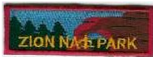
FIG. 14-4 ZION NATIONAL PARK 1" x 3"