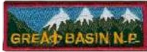
FIG. 14-2 GREAT BASIN NATIONAL PARK 1" x 3"