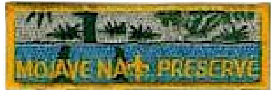
FIG. 14-7 MOJAVE NATIONAL PRESERVE 1" x 3"

CARUTHERS CANYON MID HILLS TO HOLE IN THE WALL TEUTUNIA PEAK TRAIL & KELSO DUNES (BOTH) U.S. 95 TO FORT PIUTE AND PIUTE SPRINGS