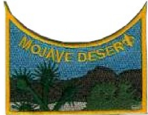
FIG. 14-6 MOJAVE DESERT 1" x 3"